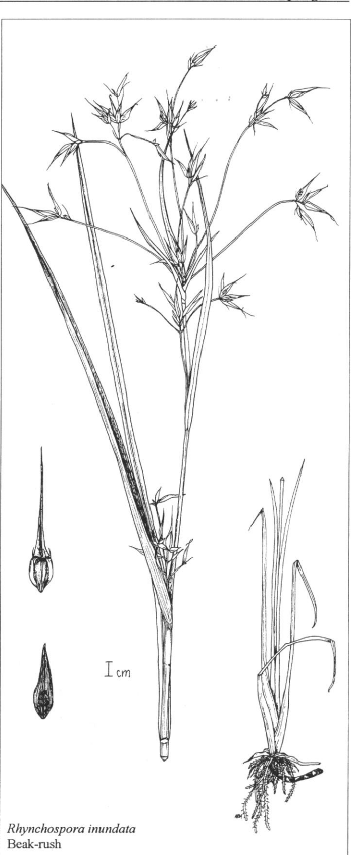
Rhynchospora Imunatia Beak-rush such as cat-tail ( Typha ), silk reed ( Neyraudia reynaudiana ), elephant grass ( Pennisetum purpurea ) and para grass ( Brachiaria mutica ), they should take care that their herbicides and flames are not also killing those unfamiliar "other plants."

Among their other responsibilities, wetland resource managers must control non-native invasive plants, lest they take over a wetland and replace native wildlife food plants. For example, F.A. Johnson noted that in central Florida, the very invasive torpedograss ( Panicum repens ) can become "dense enough to discourage waterfowl use". However, managers need to realize that when they are herbiciding, burning, chopping and otherwise controlling undesirable plants, they may also be killing very important grasses, sedges and rushes. According to Reid et al., "herbicide use has reduced grasses in the field" (46). When managers are controlling those familiar invaders